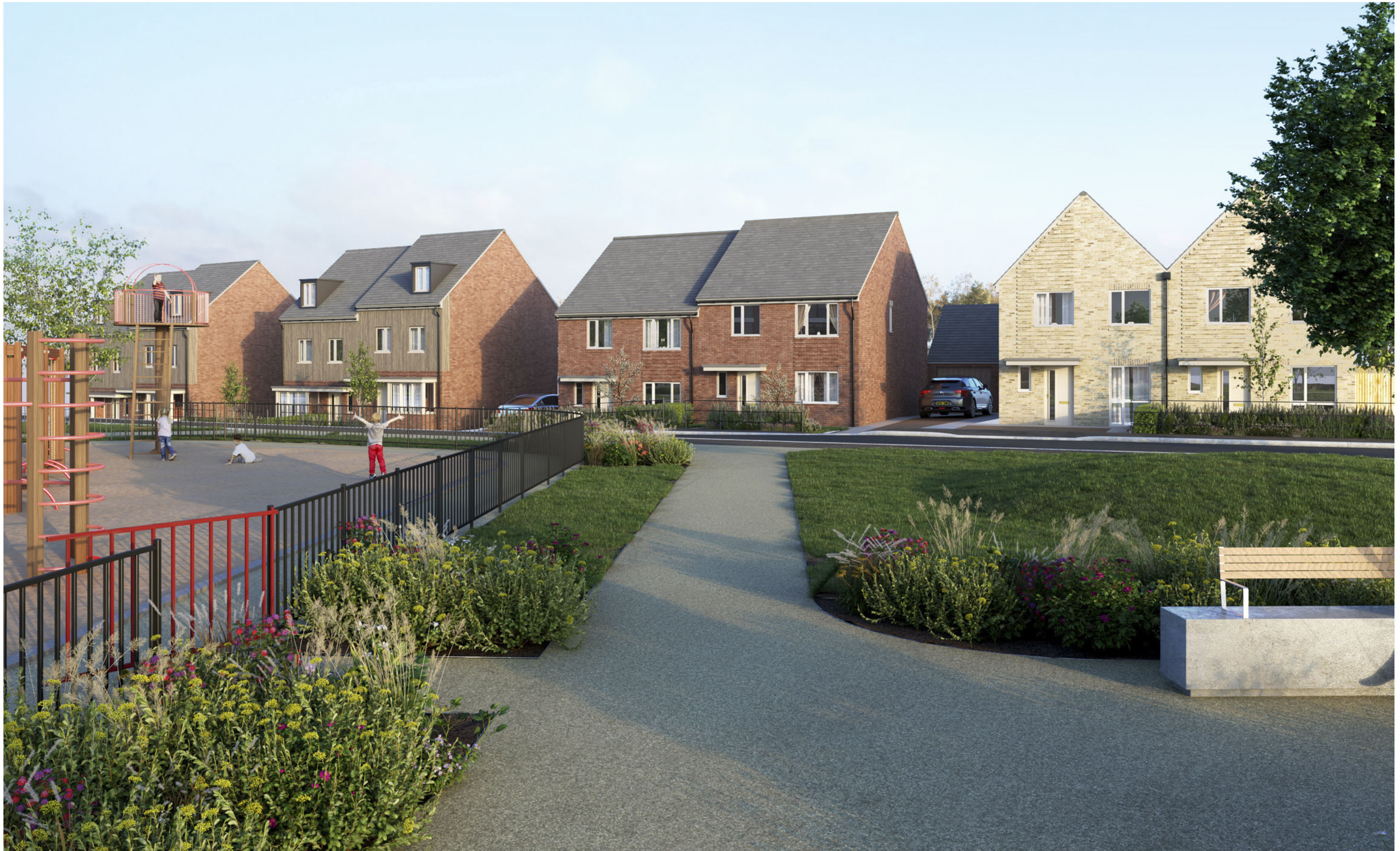
Donnington Wood Way, Telford - Parcel A View 1